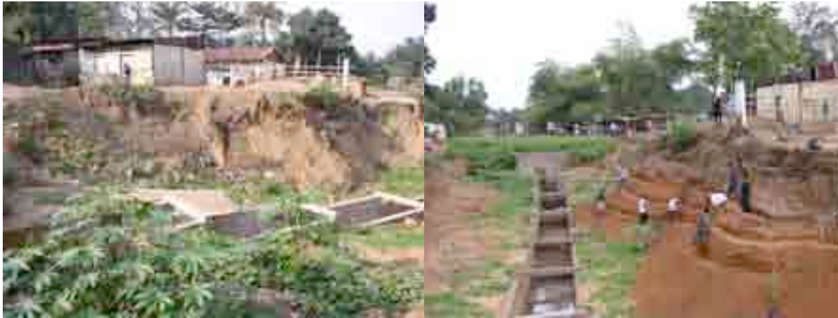
The upper end of the gully threatening the town. The picture on the right shows the gully head already stabilized with vetiver and the slopes being prepared for planting.